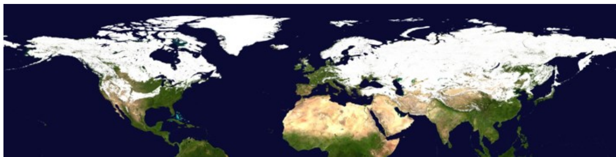
Figure 1. Northern hemisphere snow, a globally significant climate forcing and water supply for billions.

Earth's cryosphere is changing. Duration of snow cover has become shorter (1, 2), and earlier onset of snowmelt and more frequent rain-on-snow lead to earlier streamflow in snow-dominated basins (3). Climate models show more countries will experience water stress in the future, particularly those that rely on melt of snow and ice (4). Observations of glaciers show mass loss in most regions (5), and land ice loss directly contributes to rising sea level (6). The high albedo of snow – and the anthropogenic forcing's that reduce it – play a significant role in Earth's climate. Because of the vast area of earth covered by snow, small decreases in snow albedo over the Northern Hemisphere are twice as effective as a doubling of CO 2 at raising global air temperature (7). For example, during the COVID-19 lockdowns, a cleaner snowpack, presumably from a reduction in anthropogenic emissions, resulted in 6.6 km 3 of snow/ice remaining frozen instead of melting in the Upper Indus basin in High Mountain Asia (8). Understanding the current state and trajectory of global snow cover and snow albedo is critical for understanding global climate change and the impacts that changes will have on the lives of billions.