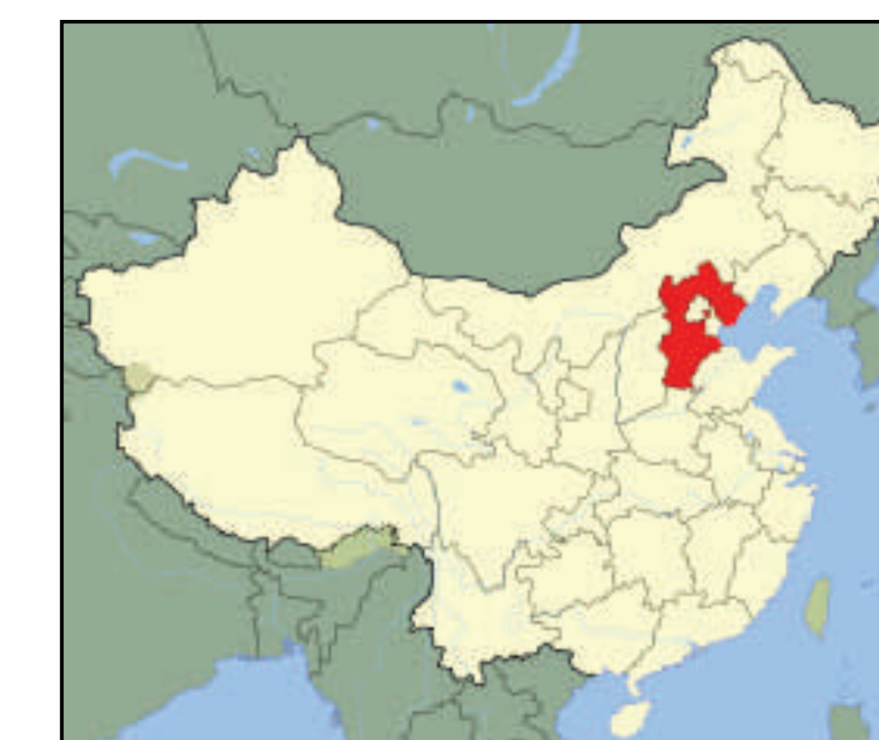
Hebei Province, China

To test our tools and generate a product for Deckers to begin implementation, we conducted a case study on a manufacturing facility in Hebei, China. The manufacturing facility is a multi-building campus that manufactures only Deckers footwear. Based on the results of our audit and using our handbook, we developed priority and secondary suggestions for the case study facility. These suggestions, which are elaborated on in the report, include the following: