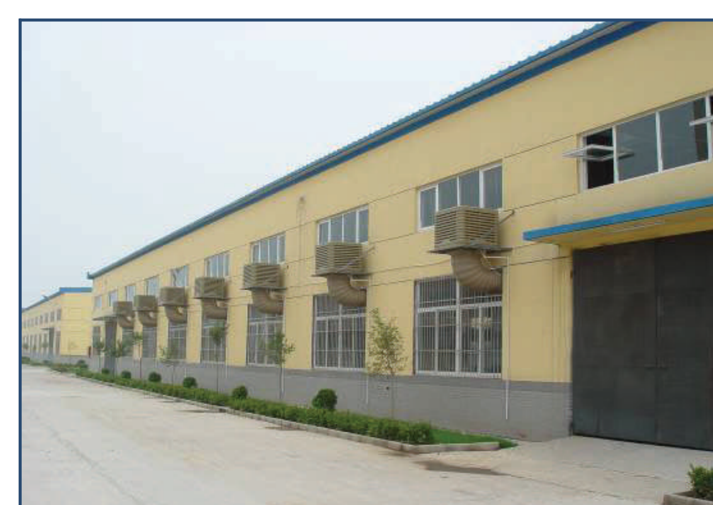
Footwear Manufacturing Facility

1. U.S. footwear consumption has increased by almost 200% since 1978, and footwear manufacture has moved to China due to decreased regulations, low-cost labor, and expertise. The vast amount of footwear consumed every year and the less stringent environmental regulations in China mean that the impacts incurred during the life cycle of each shoe combine to have significant environmental impacts.