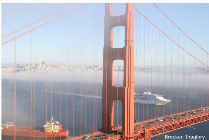
Vessel traffic through the Golden Gate

Second, we determine whether the Exclusion Area's characteristics can be considered of special national significance under the NMSA. We review the characteristics of the thirteen existing National Marine Sanctuaries to identify specific qualitative and quantitative criteria that have emerged as standards for sanctuary status over time. The criteria identified through this approach operationalize the concept of special national significance set forth by the NMSA. We refer to these criteria as "emergent sanctuary designation criteria." Third, we compare our characterization of the Exclusion Area to these emergent criteria to determine whether the Area's qualities can be considered of special national significance, and thus whether the Area meets the requirements of the NMSA.