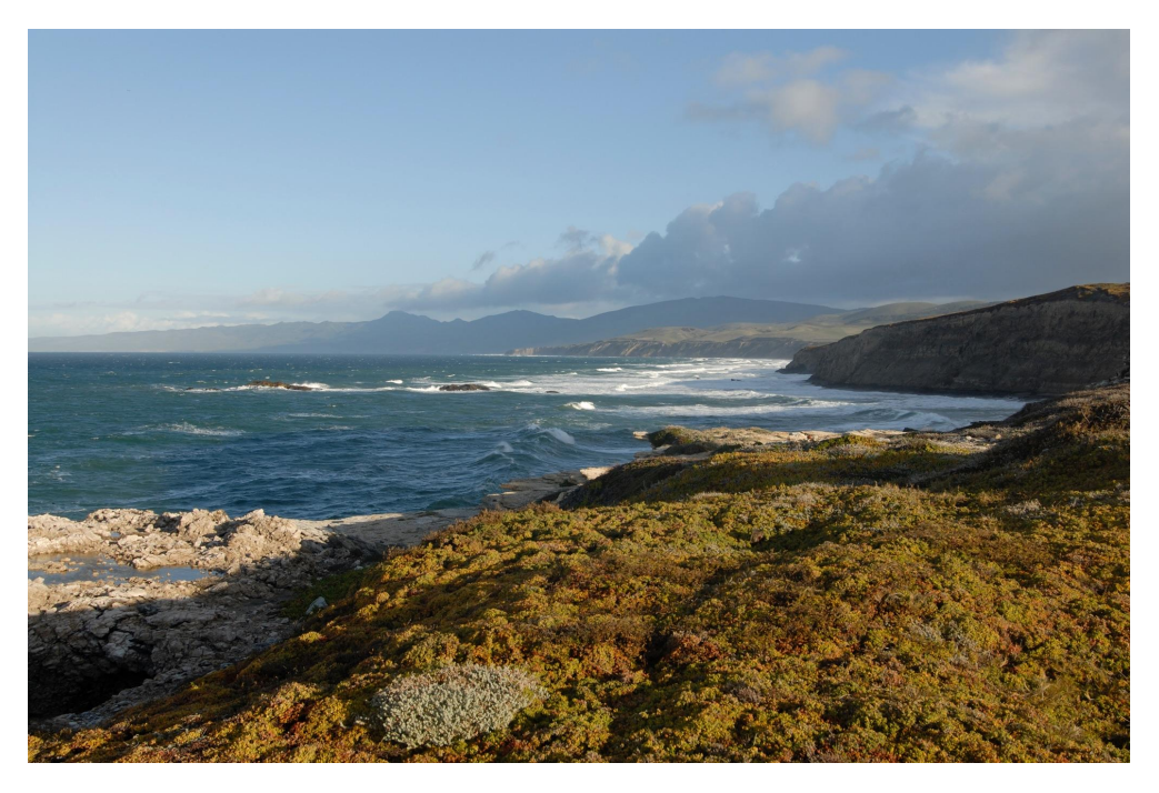
Figure 1 . Looking north from Point Conception, an area of coastline within the proposed boundaries of CHNMS [6].