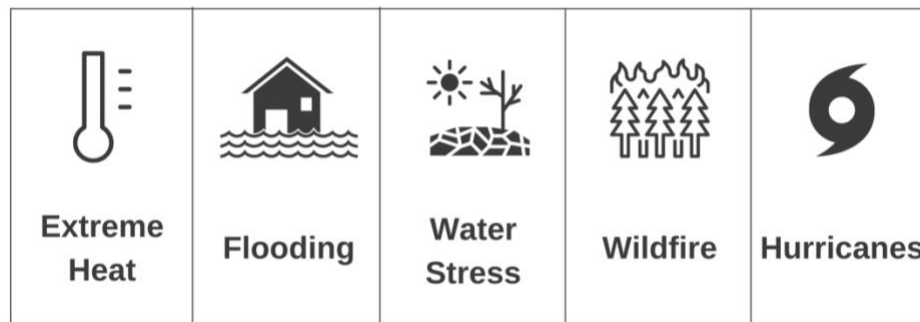
Figure 3. Climate hazards included in the scope of this analysis.

the limited scope of this and past analyses, climate hazards are analyzed independently of one another.